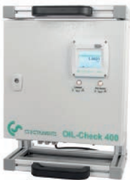
Carrying handle and stand