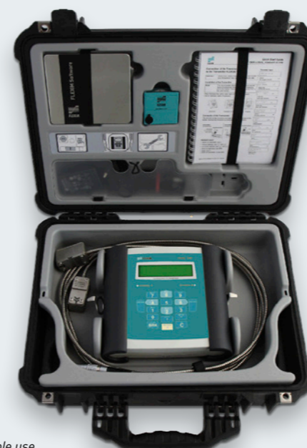
The FLUXUS® ST series is available for fixed installation and for portable use.